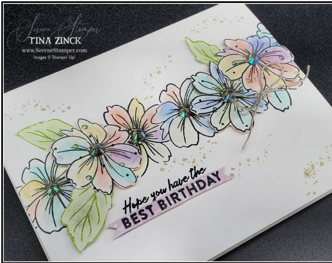
Version two: with extra flowers and more Wink of Stella (creating darker flowers)